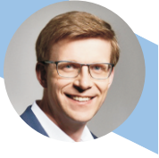
Martin Kupka Ministry of Transport of the Czech Republic